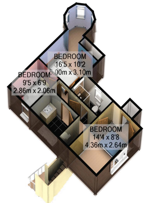
2nd Floor Approx. Floor Area 494 Sq.Ft. (45.9 Sq.M.)

Total Approx. Floor Area 3984 Sq.Ft. (370.1 Sq.M.)