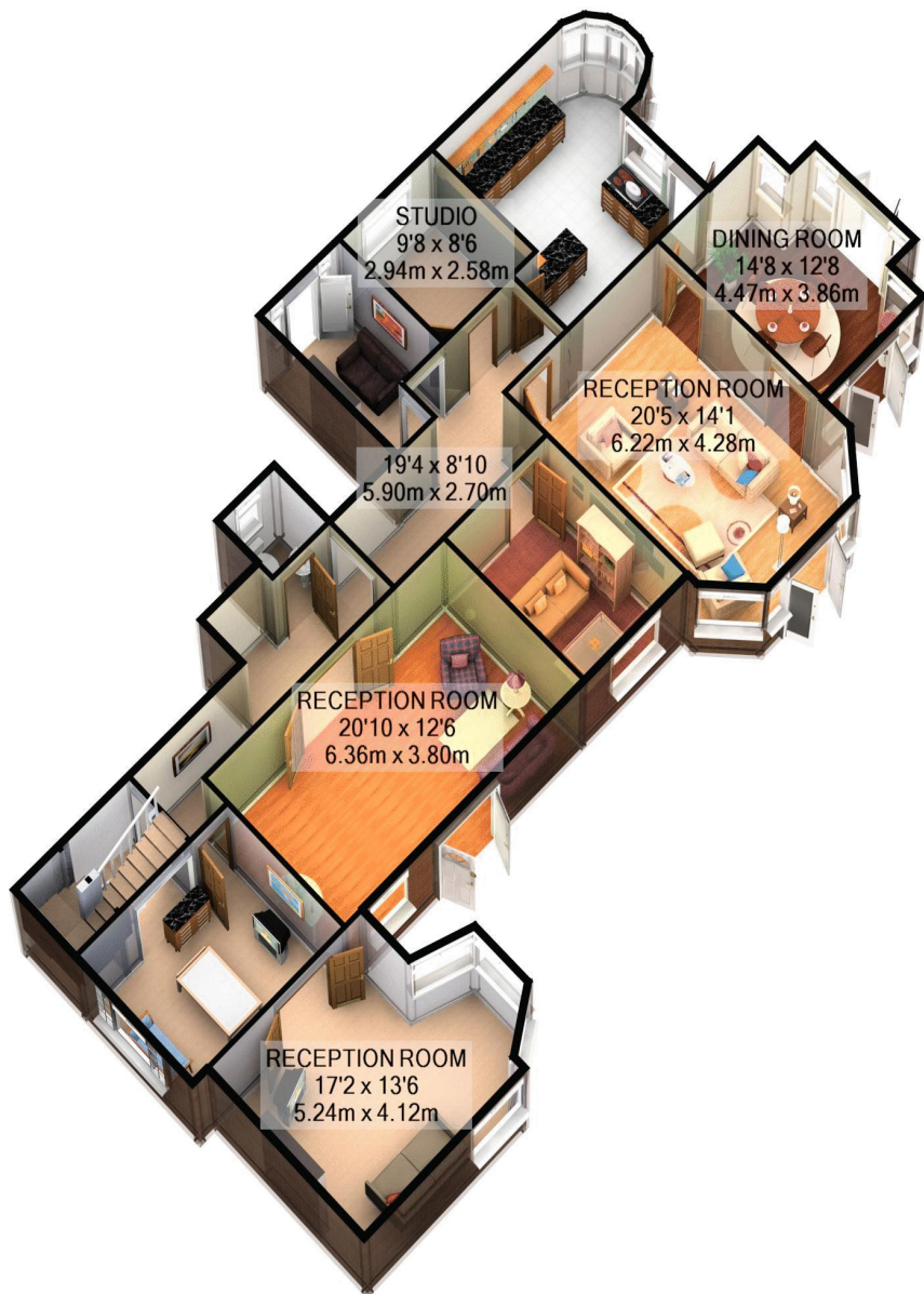
Ground Floor Approx. Floor Area 1803 Sq.Ft. (167.5 Sq.M.)